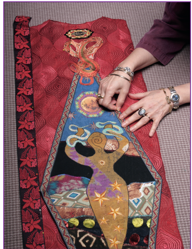
Amy at work on "The Magdalene" one of her "Spiritual Couture" special order jackets in the collection of Torie Gibraltar. The jacket is shown completed on the model in the photo below.

Devotion to their creativity is Monte's and Amy's spiritual path because they believe you are cleansing and healing yourself when you go within and tap into that creativity—it is where all the answers lie. Monte says, "We are all creative beings. It is encoded in our genetic makeup. We are all spiritual beings, too. In a very real way, creativity is spirituality. When we wish to create something that has never been before, we must first conceive of it and visualize it in our mind's eye. When we do this, we contact the essence, the spirit of what it is we wish to create. Has this spirit always existed or are we